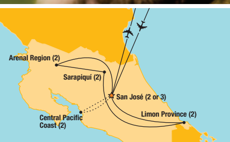
Number of overnight stays in parentheses. This tour may also be reversed.