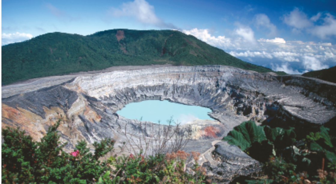
Costa Rica's Poás Volcano, which has erupted dozens of times since the first written account in 1828, features one of the world's largest geysers.

1 visit to a special attraction: Manuel Antonio National Park