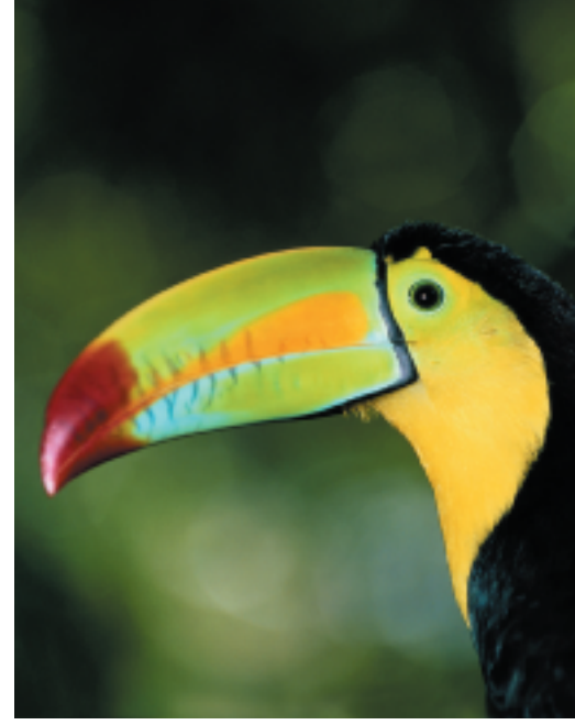
Tropical birds are just some of the wildlife you'll observe in the Costa Rican rainforest.