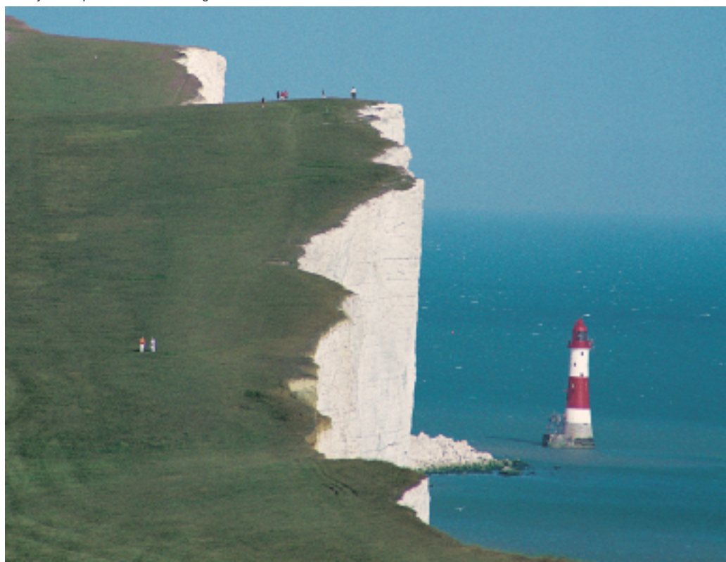
See if you can spot France across the English Channel.

Optional London Eye and Thames River cruise • Choose to see London’s sights from a different angle by taking a ride aboard the London Eye. The enormous 32-capsule observation wheel offers spectacular 360-degree views of the city as far as 25 miles in each direction. The idea for the wheel was originally conceived to mark the millennium celebration in 2000 and took six years to build. Afterwards, enjoy a cruise down the Thames.