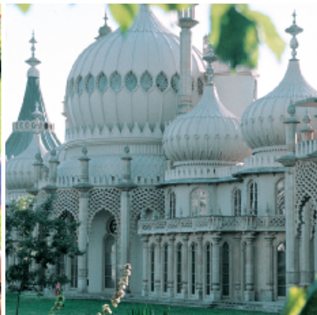
The Brighton Pavilion was constructed with an Indian theme and served as the seaside home of the Prince Regent of England.