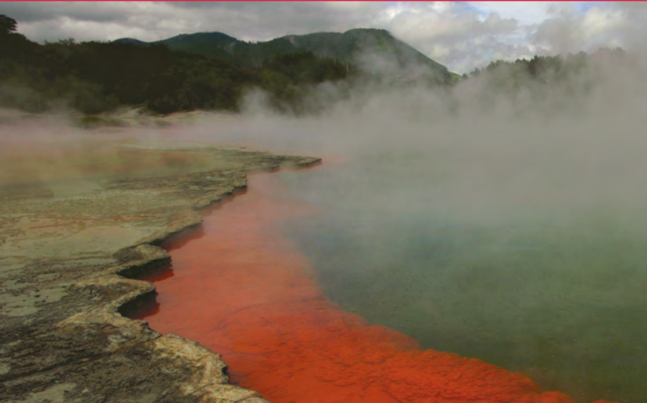
Hot mud spring Rotorua, New Zealand