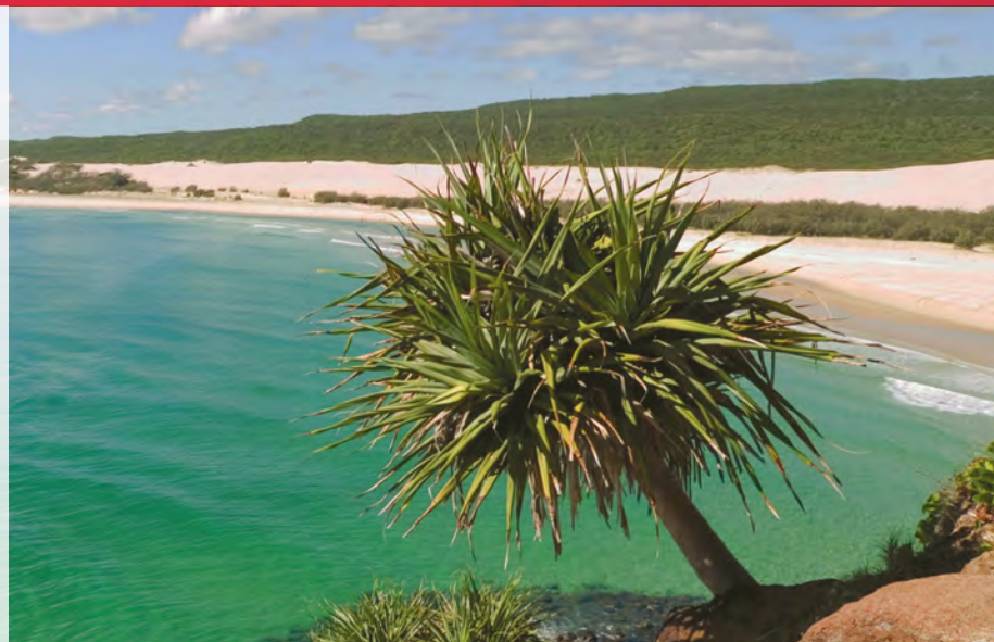
Fraser Island Queensland, Australia

Hop aboard a ferry to Fraser Island, stepping stone to the Great Barrier Reef. Named after Eliza Fraser, the lone survivor of a shipwrecked party held captive by Aborigines in 1836, this is the world's largest sand island. A naturalist's paradise, the island includes beaches, dunes, streams and marshes. Be on the lookout for native wildlife, including wild horses, known here as "brumbies." You'll stay at the beautiful Kingfisher Bay Resort, which has been carefully designed to coexist with the island's ecological systems. Energy conservation, waste minimization and composting are integral to the hotel's philosophy. What's that colorful bird on the veranda? Or that exotic-looking flower alongside the path to your room? Ask one of the on-site rangers!