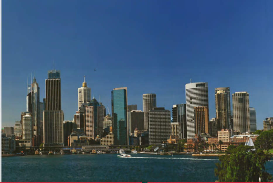
City skyline Sydney, Australia

It's easy to see why this stunning, cosmopolitan city won the hearts of many as the host of the 2000 Olympic Games. Enjoy a bird's-eye view of the city from the observation deck of Sydney Tower. At 1,063 feet, it's the second-tallest building south of the Equator! See the skyline from a different angle on your boat tour of Sydney Harbour—and snap a picture of the iconic Opera House. Stop at Bondi Beach to get up-close to koalas and kangaroos at Sydney Wildlife World. Then, shop for souvenirs in the historic Rocks district. Situated in the shadow of the Sydney Harbour Bridge, this well-preserved colonial neighborhood marks the spot where Australia's first fleet of European settlers landed in 1788.