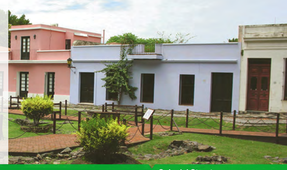
Colonial Street Colonia del Sacramento, Uruguay

Take a full-day excursion across the Rio de la Plata to Uruguay and explore the quaint colonial city of Colonia del Sacramento. Originally founded as a Portuguese outpost situated on a strategic waterway, Spain gained control of the fortress in 1777. Now, it is a resort city, a port, and a popular trade center for agriculture. With its quintessential cottages and cobblestone roads, Colonia del Sacramento was named a UNESCO heritage site in 1995. Explore the area's colonial architecture, winding streets and colorfully tiled homes. See the Church of Matriz del Santisimo, the oldest church in Uruguay, as well as the Plaza Mayor, the House of Viceroy and the ruins of a Franciscan convent.