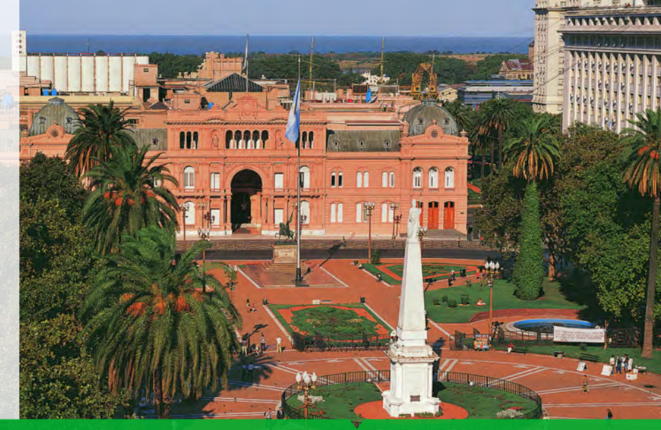
Plaza de Mayo Buenos Aires, Argentina

Discover Buenos Aires, birthplace of the tango! Not only will you experience examples of this city's cosmopolitan European elegance such as the Colón Theater and its colorful architecture in the La Boca district, you'll also visit a traditional Argentinean ranch for a Fiesta Gaucha. See gauchos demonstrate their legendary skills on horseback, tour the ranch, experience traditional folkloric songs and dances and enjoy a traditional asado barbecue for lunch. You'll also take an excursion to Tigre including a boat ride along the Paraná Delta, a vast ecological preserve that stretches nearly 200 miles through the country.