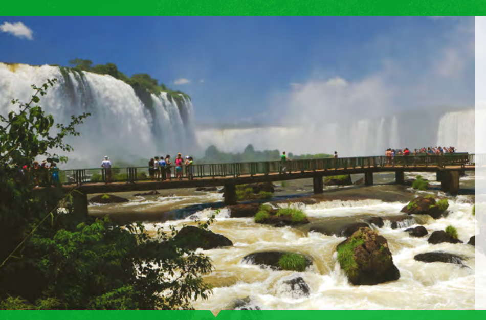
Iguaçu Falls Misiones, Argentina