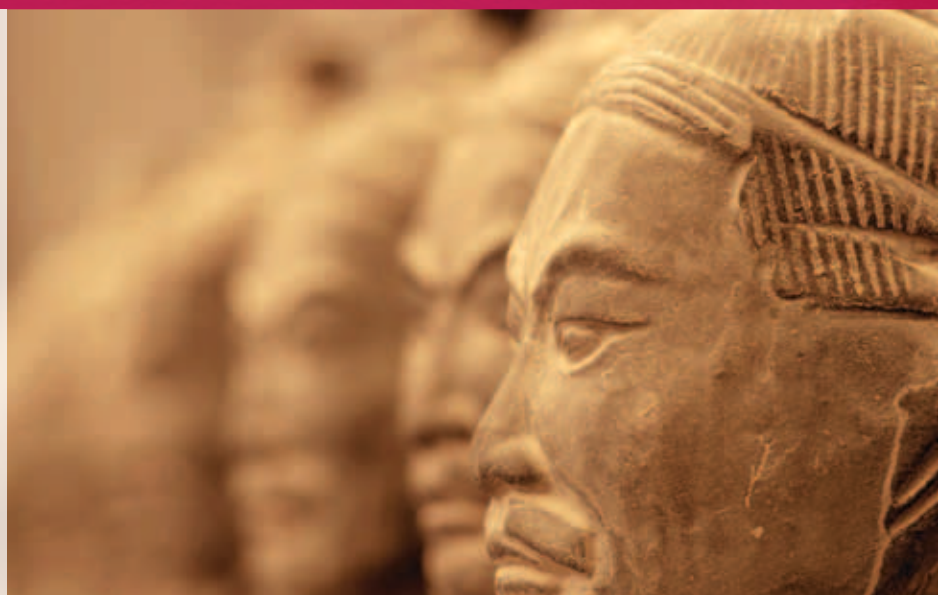
Terracotta Warriors Xi'an, China

The massive wall surrounding Xi'an is a testament to the city's importance: it has served as the capital of 11 dynasties. Follow in the footsteps of Silk Road traveler Marco Polo during your sightseeing tour. Visit the life-size sculptures known as the Terracotta Warriors, which were created to protect the tomb of Emperor Qin Shi Huangdi, founder of the Qin Dynasty. Of these 6,000 models, no two are alike. Watch how these treasures were excavated in a fascinating 3D film. You'll also see the 7th-century Big Wild Goose Pagoda, built upon the orders of Xuan Zang, the monk who introduced Buddhism to China.