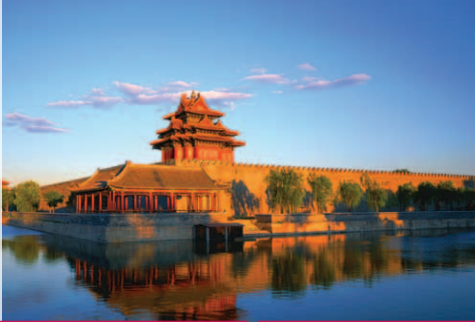
The Forbidden City Beijing, China

Experience the excitement of Beijing! On your sight-seeing tour, step back in time in the Forbidden City, whose grandeur is epitomized by the golden-roofed Imperial Palace. Discover the principles of Taiji on the magical garden grounds of the Summer Palace. Stand in Tiananmen Square, a site of worldwide cultural significance. On a local school visit you'll interact with Chinese students in their classroom. In the evening, share a regional specialty at your Peking Duck dinner. And finally, no trip to Beijing would be complete without an excursion to the Great Wall of China. Construction of this 3,000-mile man-made marvel, used to defend the Chinese Empire against northern invaders, began in the third century B.C. Don't forget your camera!