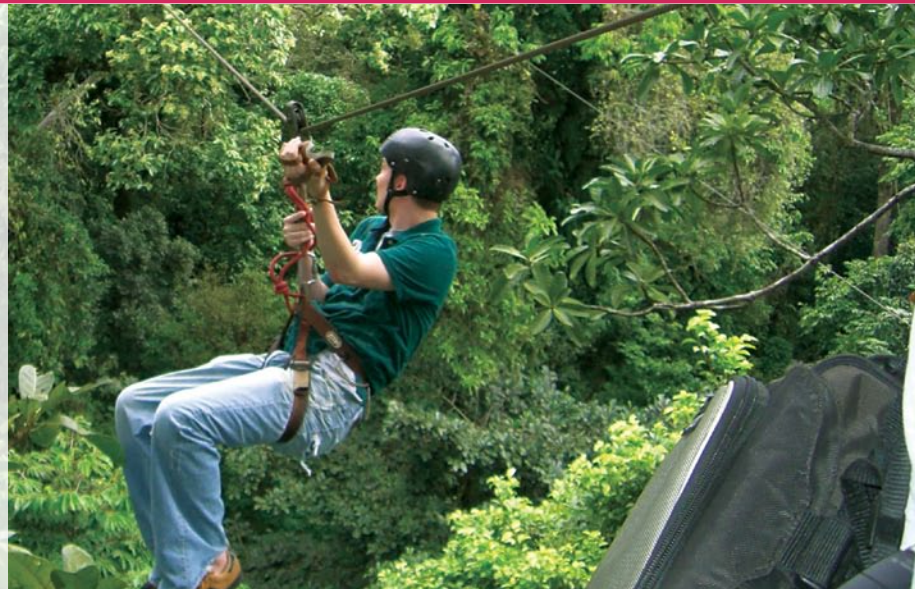
Canopy tour Monteverde, Costa Rica

Situated near the Continental Divide, the Monteverde (Green Mountain) Reserve contains a spectacular range of flora and fauna in six distinct ecological zones. On your excursion you'll tour the greenery of the Santa Elena Cloud Forest, a special part of the reserve. Look for rare orchids and elusive quetzal birds that thrive in Monteverde's perpetual soft mists—at this altitude, you'll literally walk through clouds. Leave your mark on the earth when you plant a tree in the EF reserve. Then, stop at a local school, where you'll have the chance to interact with Costa Rican students. During your visit, sample and share homemade specialties with the new friends you've made.