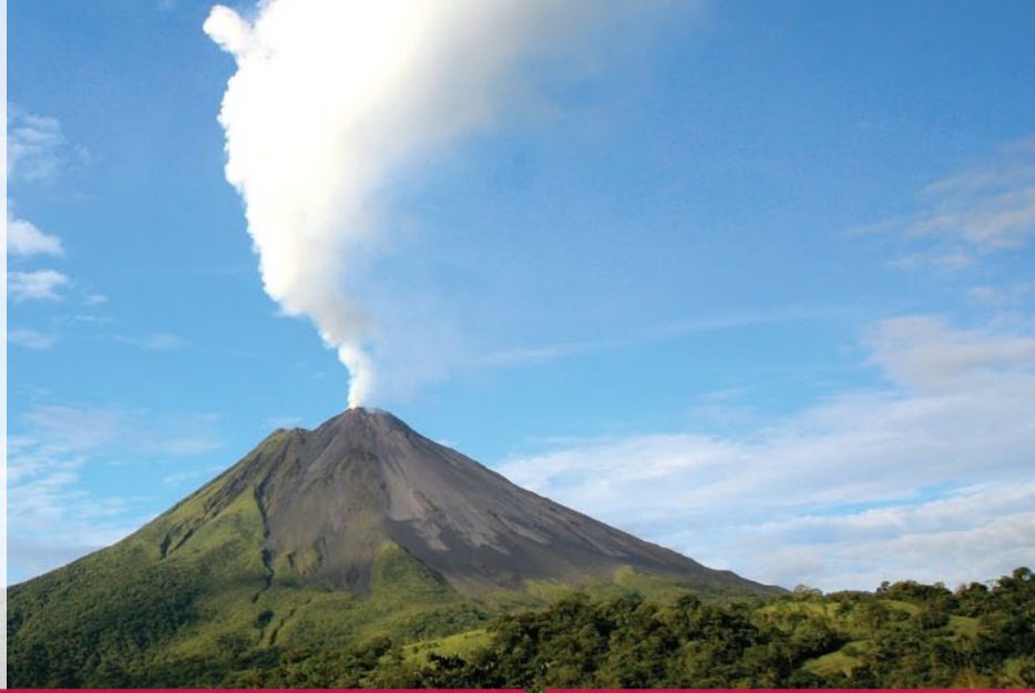
Arenal Volcano Arenal, Costa Rica

The Arenal Region in northwestern Coast Rica is dominated by the mile-high Arenal Volcano, one of the 10 most active volcanoes in the world. Active for the past 4,000 years, its perfect conical shape emerges from the green hills of Alajuela. Located at the base of the volcano is breathtaking Lake Arenal, which produces about 60 percent of Costa Rica's hydroelectric power. Home to more than 400 species of birds and 10 species of fish, the lake's coves, lagoons and river outlets are perfect for exploring by kayak. One of Costa Rica's most spectacular waterfalls, La Fortuna, is located within the thick jungle of the Arenal Rainforest.