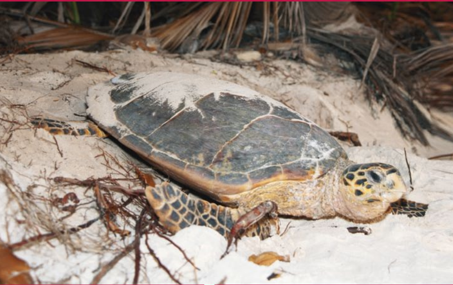
Green sea turtle Tortuguero, Costa Rica