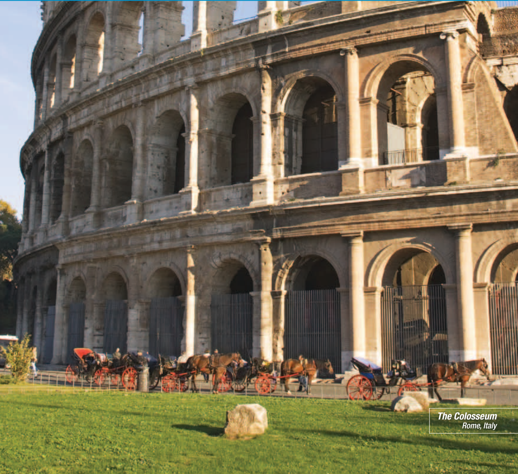
The Colosseum Rome, Italy