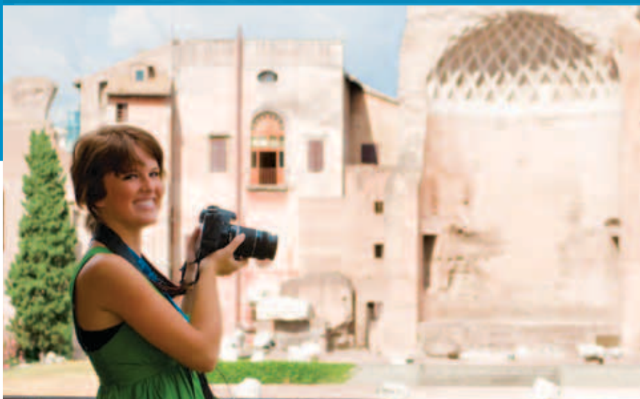
Roman ruins Rome, Italy