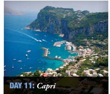
DAY 11: Capri