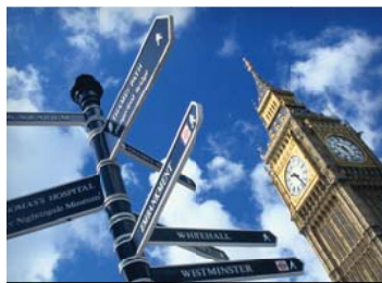
DAY 3: Big Ben