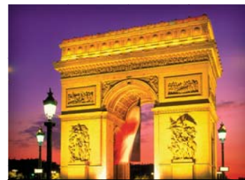
DAY 5: Arc de Triomphe