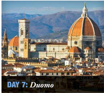
DAY 7: Duomo

Extend your tour and enjoy extra time exploring your destination or seeing a new place at a great value.