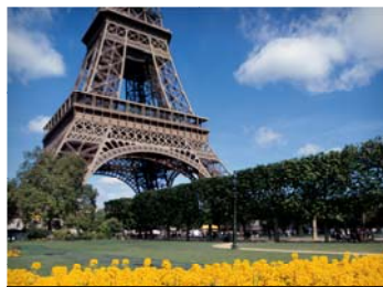
DAY 5: Eiffel Tower