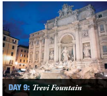
DAY 9: Trevi Fountain