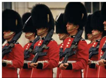
DAY 3: Grenadier Guards