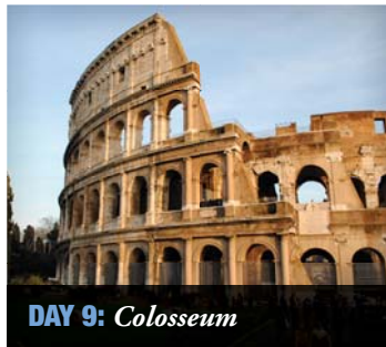
DAY 9: Colosseum