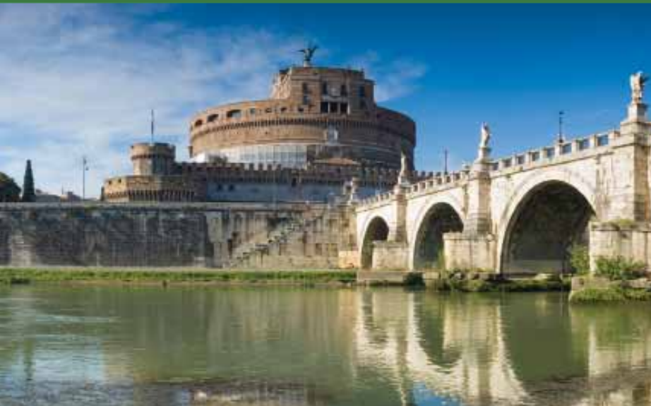
Saint Angelo Castle Rome, Italy