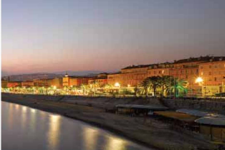
Promenade des Anglais Nice, France

Stroll down the palm-lined Promenade des Anglais and get a taste of the Old Town during your walking tour of Nice. Soak up the scenery, from the white-washed villas to the flower market to the emerald waters that lap Nice's endless beaches. Enjoy an excursion to the seaside town of Eze. You'll tour a perfume factory and watch olfactory experts concoct new fragrances. Then, visit Monaco, a tiny principality that packs wealth, royalty and the world-famous Casino Monte-Carlo into just 0.8 square miles. Pass by the Cathédrale de Monaco, where Prince Rainier wed movie star Grace Kelly, a union that ultimately sparked an influx of Hollywood stars and starlets to the French Riviera.