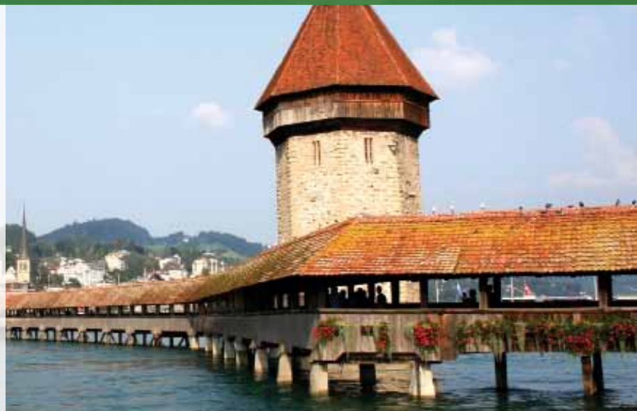
Chapel Bridge Lucerne, Switzerland

The majestic Swiss Alps rise behind the shores of Lake Lucerne and provide the stunning backdrop to one of Switzerland's most picturesque cities. You'll see the moving Lion Monument, a sandstone statue commemorating the Swiss Guards slain in the 1792 Paris storming of the Tuileries. Follow Lucerne's winding cobbled streets past fairy-tale houses to the Chapel Bridge. Stroll along this covered bridge, which dates back to medieval days, and admire the colorful murals overhead. You'll have the option to join an excursion that takes you up Mount Pilatus. There, you'll be rewarded with spectacular panoramic views of Lucerne.