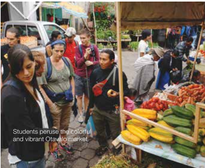
Students peruse the colorful and vibrant Otavalo market