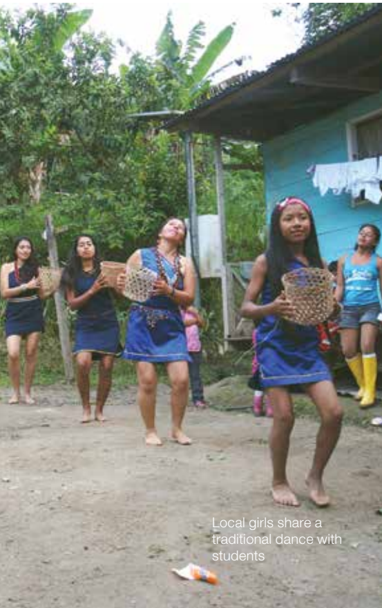
Local girls share a traditional dance with students