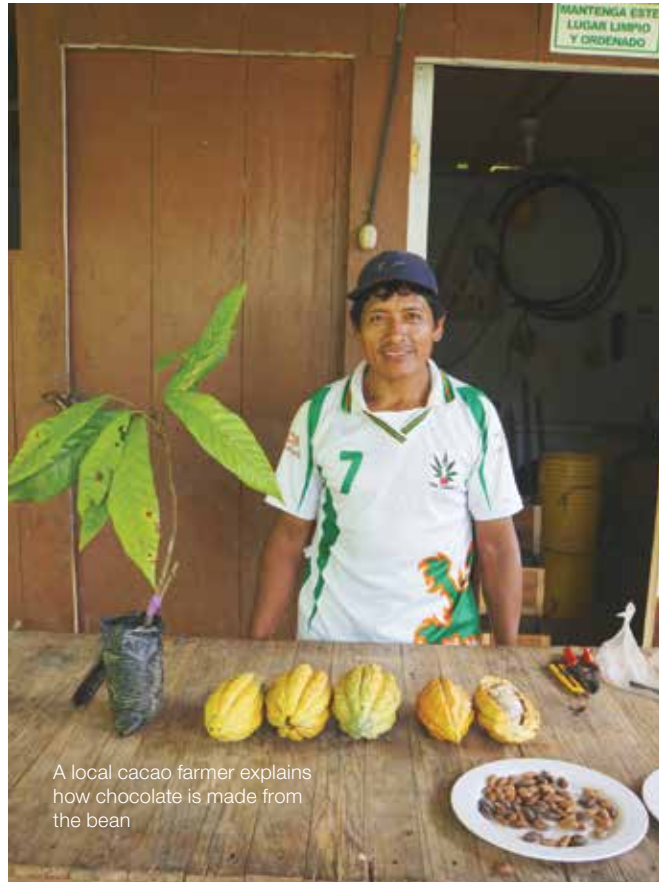
A local cacao farmer explains how chocolate is made from the bean