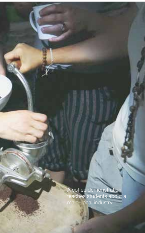
A coffee demonstration teaches students about a major local industry