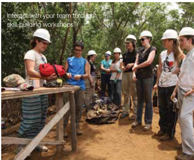
Interact with your team through skill-building workshops