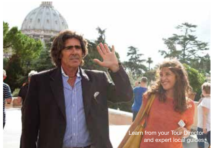
Learn from your Tour Director and expert local guides