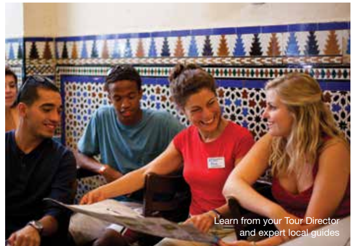
Learn from your Tour Director and expert local guides